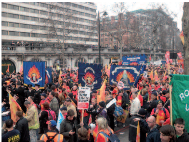
Rank & file FBU members supported the project

The Scottish FBU Executive determined to source and deliver a project that would provide the required kit and equipment at the earliest possible opportunity.