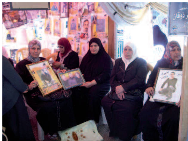
Mothers of the prisoners in Martyr Square, Nablus

The Nablus fire-fighters had arranged for us to have an afternoon barbecue with them to thank us for our support, that evening they took us to a restaurant to listen to Palestinian folk songs and enjoy a, non alcoholic, cocktail.