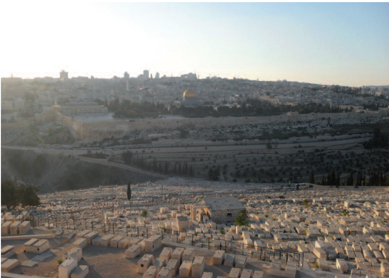
Dome of the Rock, East Jerusalem