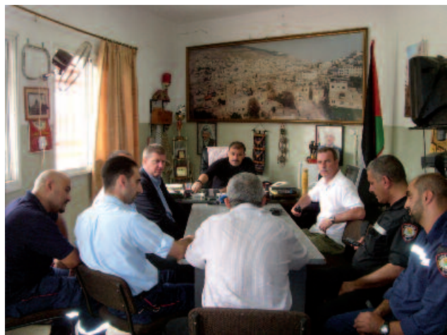
Nablus meeting with fire-fighters