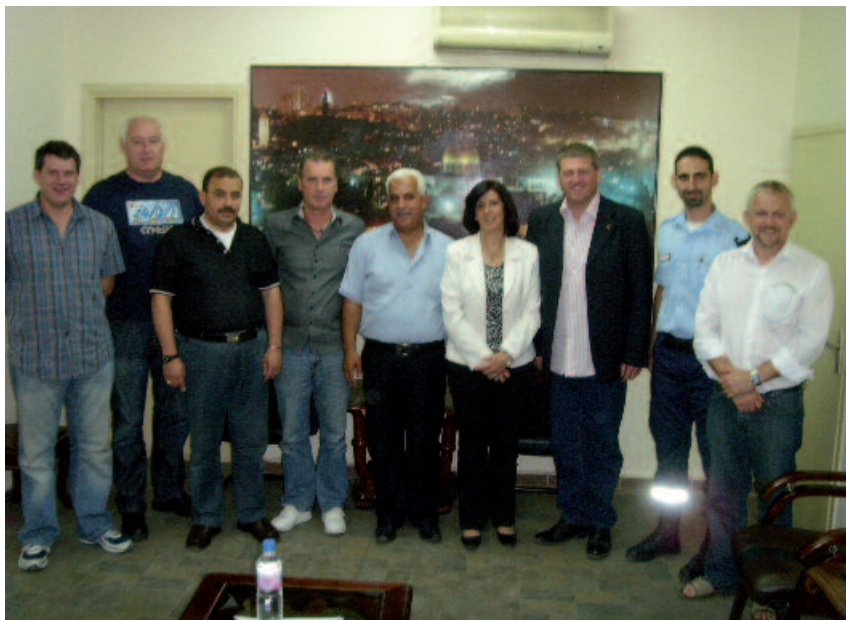
Nablus Governate meeting at PLO HQ