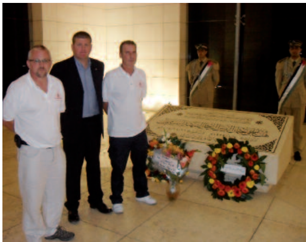
Tomb of PLO President Yasser Arafat