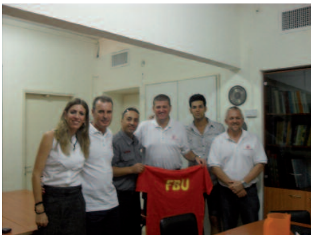
Histradrut meeting, Tel Aviv