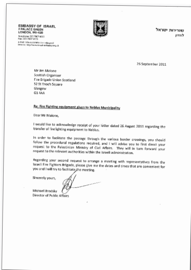
Letter from the Israeli Ambassador