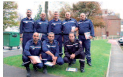
NABLUS 8 Fire-Fighters in Scotland 2009

It was identified that Personal Protective Equipment (PPE), would be of most assistance.