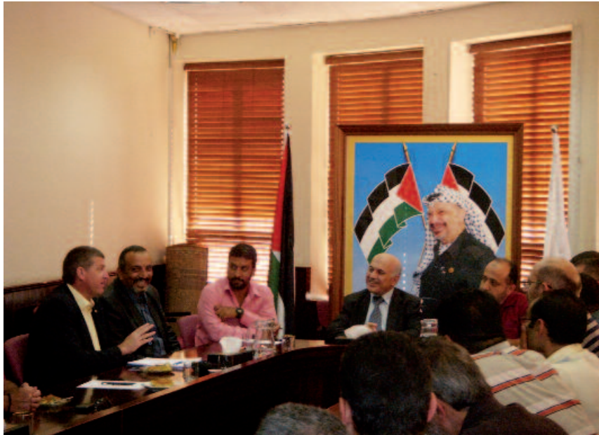
Mayor Adli Yaish & Trades Council

appears, to achieve the desired outcome, you must be able to shout louder than the Mayor and shake your fist aggressively in his face, after the shouting, tea, coffee and sweet cakes were consumed in a calm respectful atmosphere.